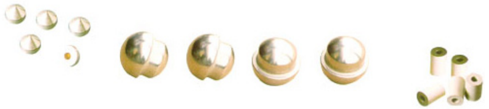
Magnets for Jewelry