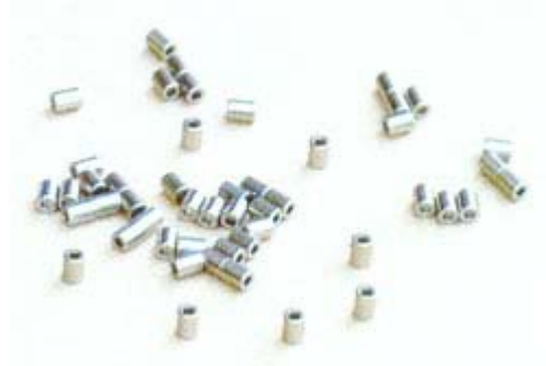
Mobile Vibrancy Alinco